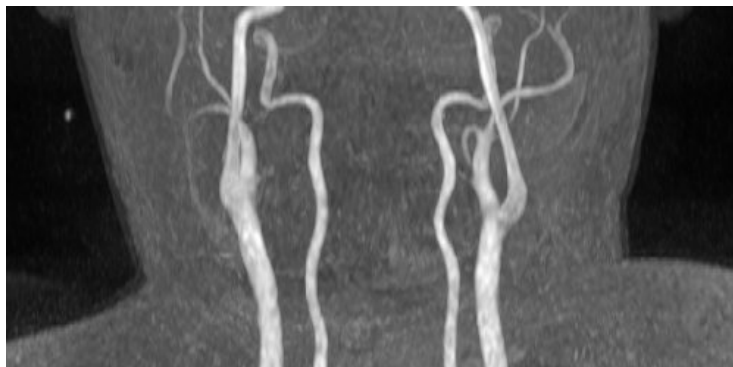
Fig. 2. 3D inflow image with Sense reduction factor 6