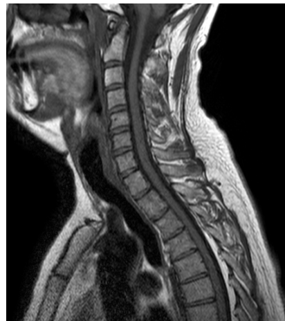
Fig. 3. T1W spine image with Sense reduction factor 2 ->